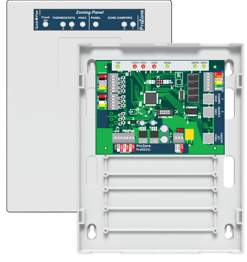
Made in the USA

The ProR221J features out of the box operation, plug and play dampers, tutorial installation and cloning making the panel an economical and powerful solution for the RNC market and retrofit applications.